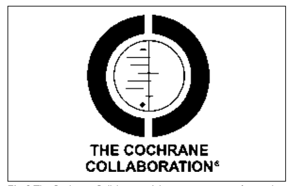
Fig. 2 The Cochrane Collaboration's logo incorporates a forest plot.

Systematic reviews appear at the top of the hierarchy of evidence. This reflects the fact that, when rigorously conducted, they should give us the best possible estimate of any true effect. However, caution must be exercised before accepting the findings of any systematic review without first appraising it. Like any piece of research, a systematic review may be done poorly. Not all systematic reviews are rigorous and unbiased. Little attention may have been paid to the intervention, the patient selection group or the search strategy; or the systematic review may have combined studies in meta-analysis which should not have been pooled because they differ in terms of intervention used or participants included. Therefore, it is important that users of systematic reviews become familiar with the steps involved